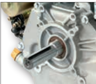
Albero cilindrico D.19,05 Cilindric shaft